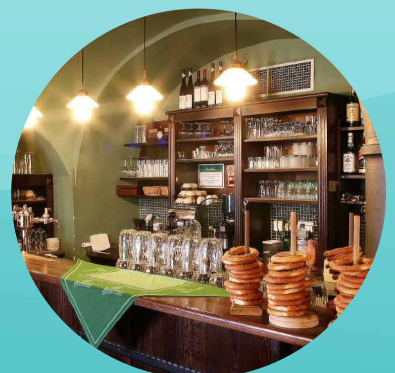
Šenk Na Parkánu

How far it is from Accommodation: 3,2 km