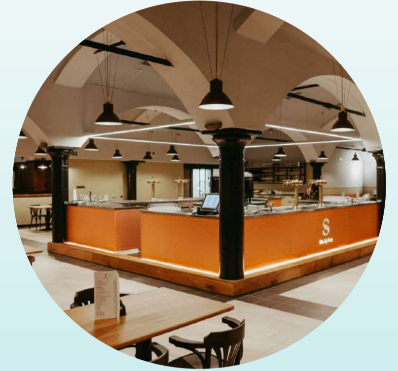
Na Spilce pub

How far it is from Accommodation: 2,6 km