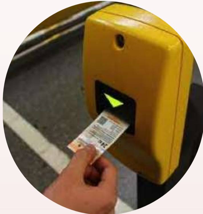
Validating ticket machine

Timed tickets for public transport are available either in big yellow machines in every metro hall or online in portal Lítačka (also available as an app). We recommend buying the 30 minute ticket (30 CZK), as it should be sufficient for your journey to the Hlavní nádraží station.