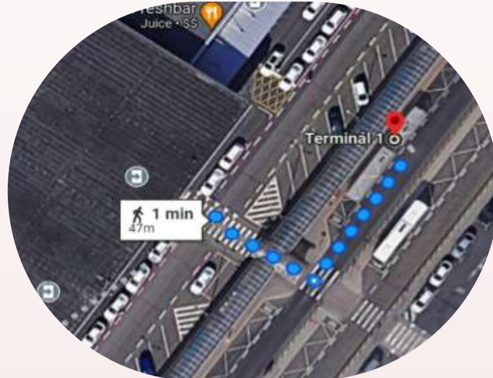
The route from the airport building to the bus stop

If you do decide to use the metro, don't forget to validate your ticket in one of the yellow boxes located right before the ticket compulsory area. For further information, we recommend using the PID website .